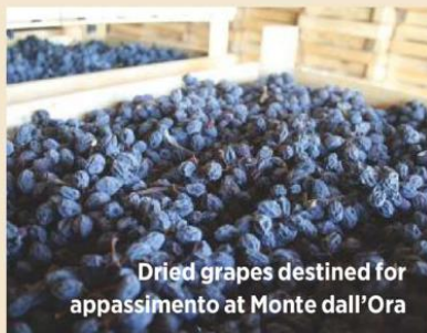
Dried grapes destined for appassimento at Monte dall'Ora

Occasionally a back label will state that the wine has been produced from uve leggermente appassite (lightly dried grapes) or refer to double fermentation where dried fruit must has been